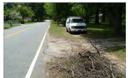
Above: Sidewalk/maintenance needed on Maple St.