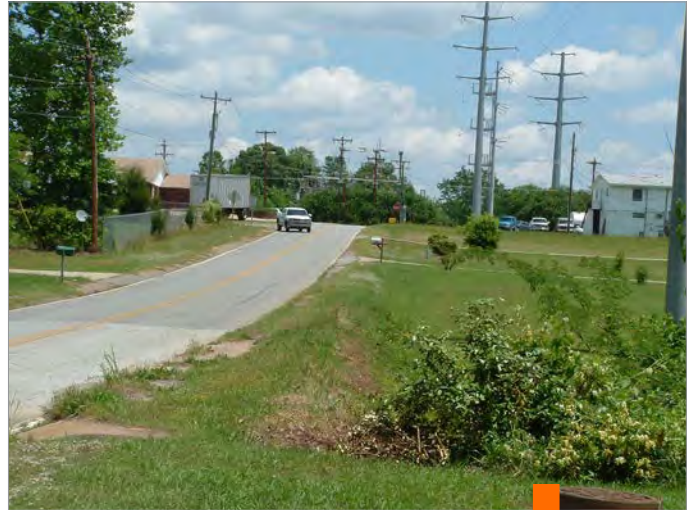
Above: existing conditions along Goforth Street.