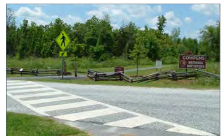
Above: Cowpens National Battlefield