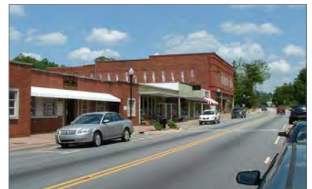
Above: Downtown Cowpens