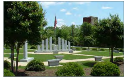
Above: Veterans Park